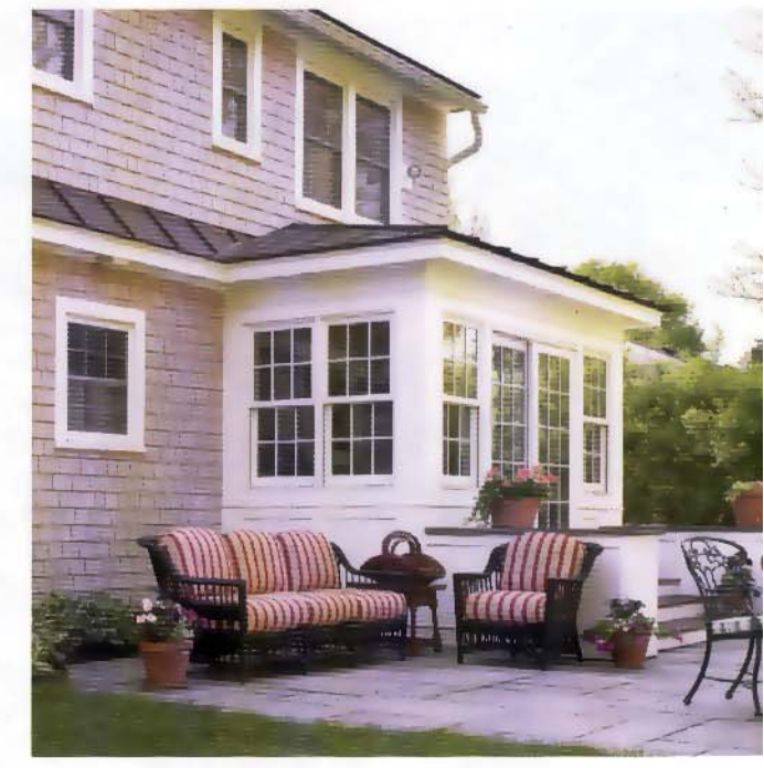
OPPOSITE On the breakfast-area ceiling, built-up moldings mimic exposed beams, adding architectural interest and delineating the space. LEFT The built-in fireplace was inspired by a wood-burning stove the homeowners had in a previous dwelling. Its sleek profile hugs the wall, leaving a clear path between the kitchen and breakfast area. ABOVE A new patio complements the bump-out to the back of the house, providing an inviting outdoor option.

PROBLEM The small, narrow kitchen of a 1950s home lacked light, storage, and architectural character, and its floor plan complicated cooking and traffic flow.