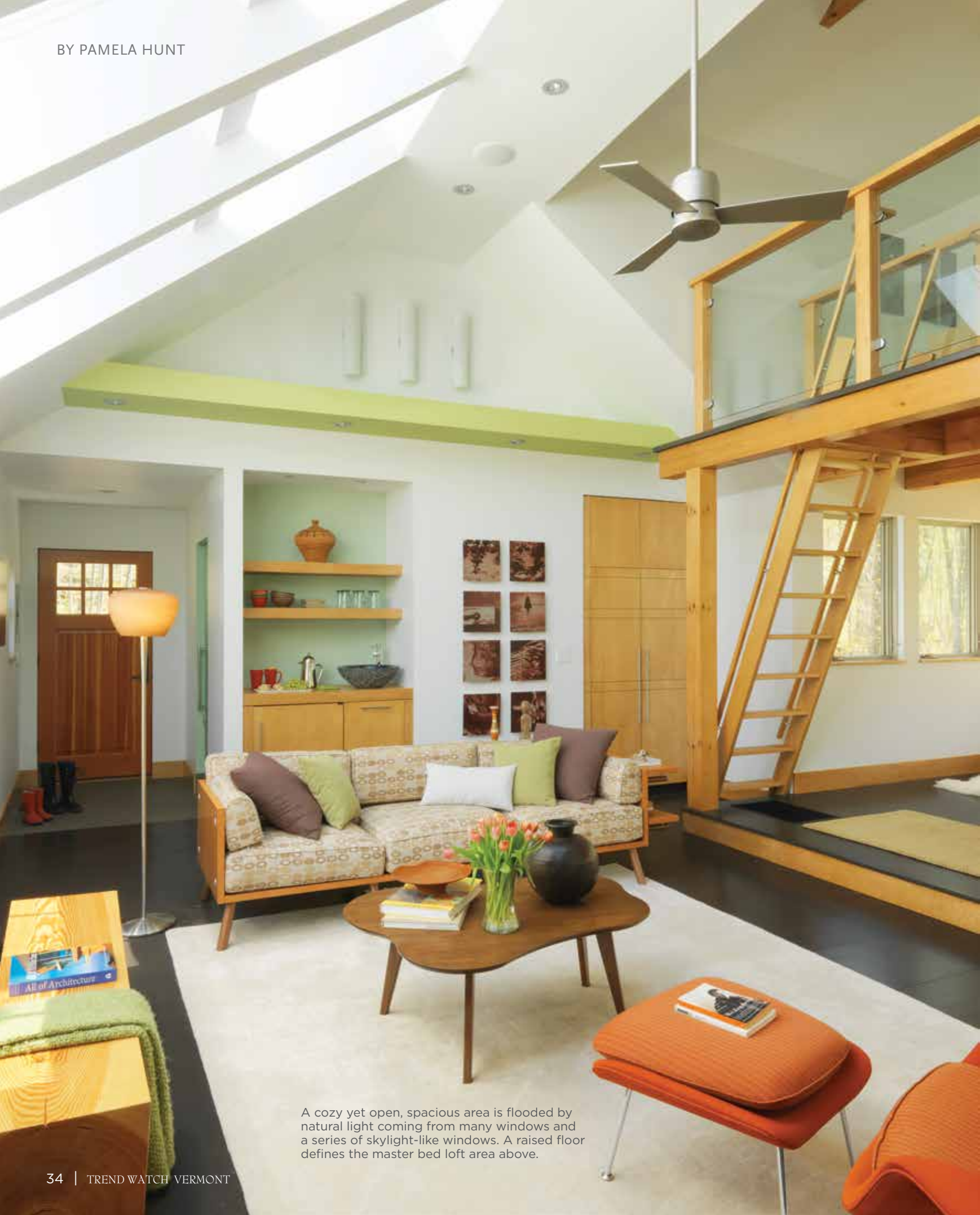
A cozy yet open, spacious area is flooded by natural light coming from many windows and a series of skylight-like windows. A raised floor defines the master bed loft area above.